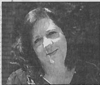
By Sherry Jackson CONTRIBUTING WRITER

Located in the North Carolina High Country, at 3,333 feet, Boone, North Carolina offers a cool summer retreat (summer highs average 75 degrees) while the rest of the South is sweltering during the dog days of summer.